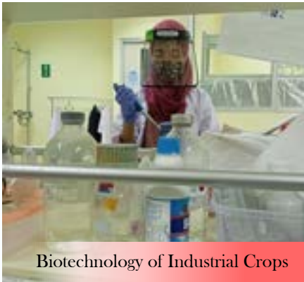
Biotechnology of Industrial Crops