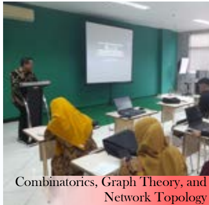
Combinatorics, Graph Theory, and Network Topology